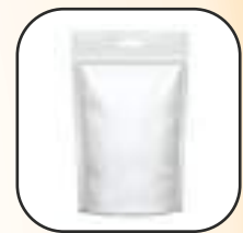
STAND-UP & ZIPPER POUCHES