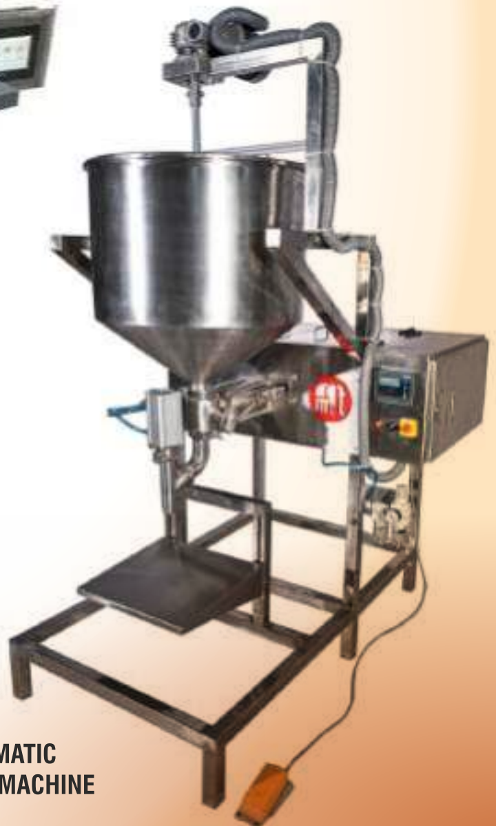
SEMI AUTOMATIC PASTE FILLING MACHINE