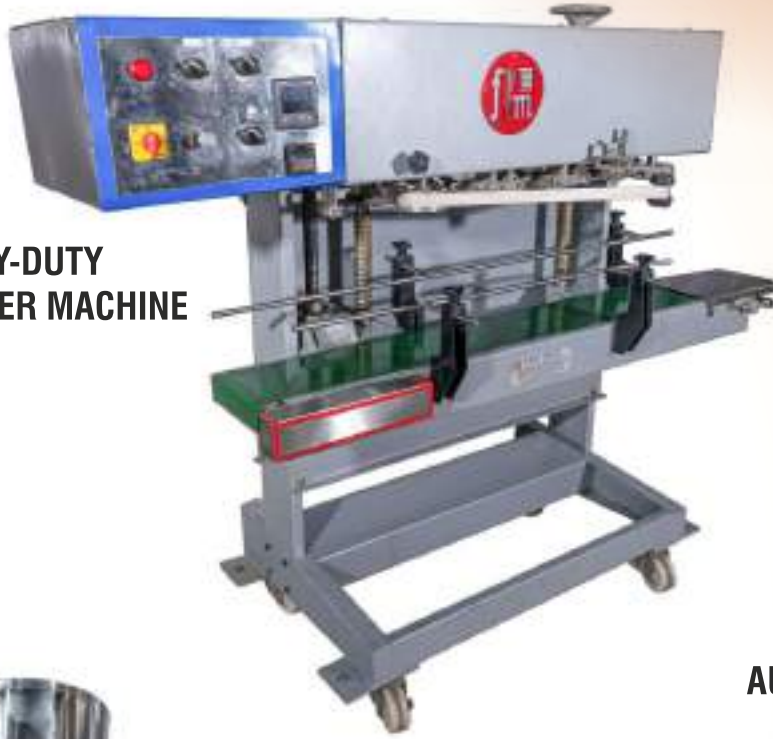
HEAVY-DUTY BAND SEALER MACHINE