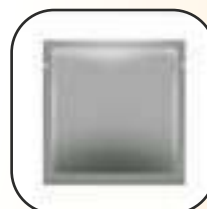
FOUR SIDE SEALED POUCH