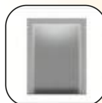
THREE SIDE SEALED POUCH