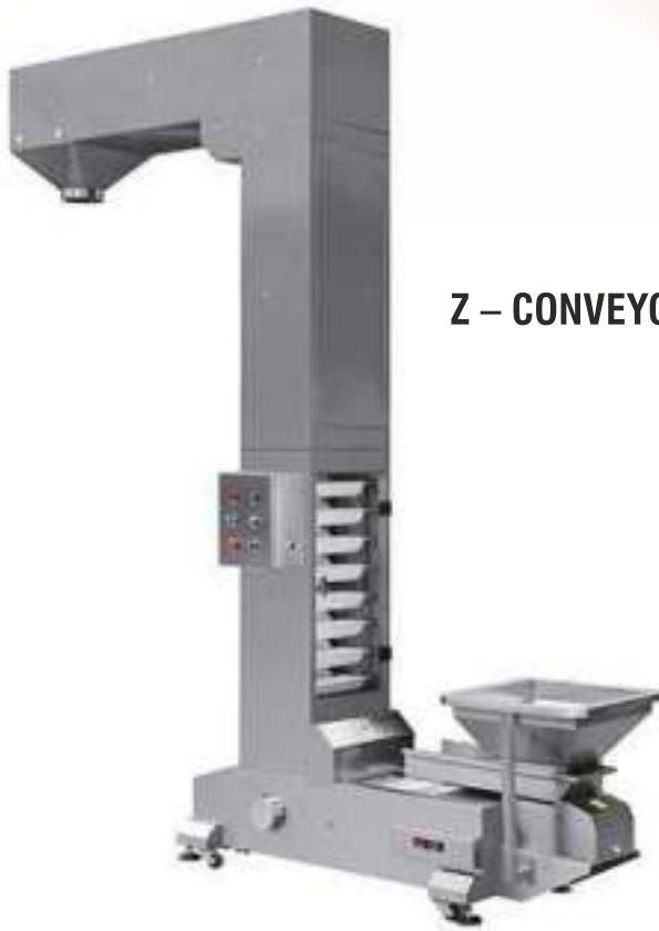
Z – CONVEYOR