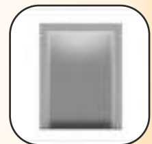
THREE SIDE SEALED POUCH