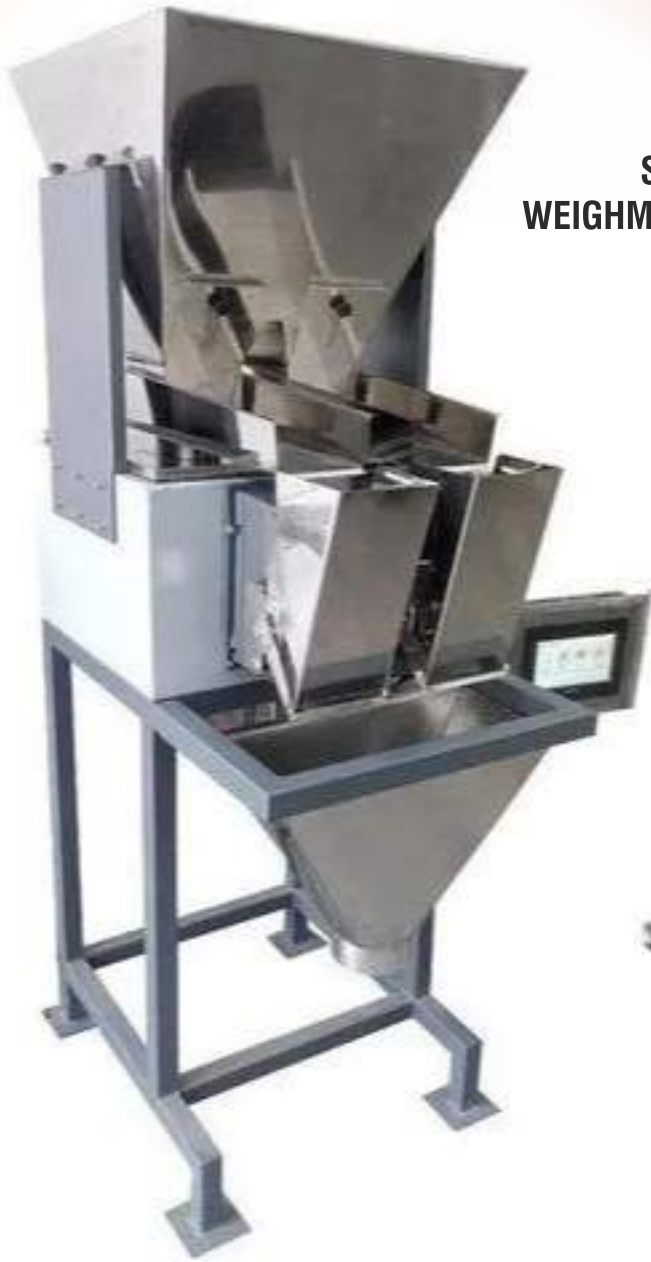
SEMI AUTOMATIC WEIGHMETRIC FILLING MACHINE