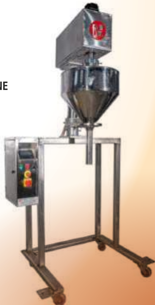
SEMI AUTOMATIC AUGER FILLING MACHINE